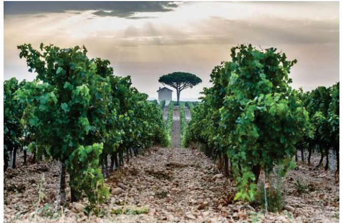
Vines in the 'delta' of Costières de Nîmes.